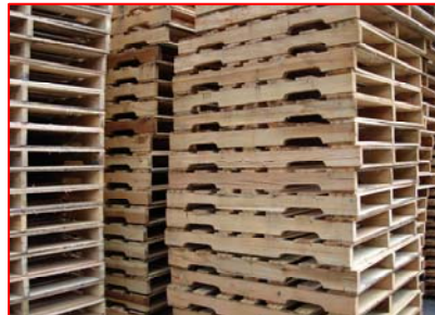
Complete range of saws for Pallet Production