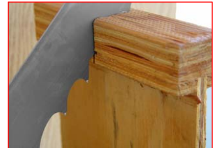
Bi-metal and Carbide tip saws for specialty applications