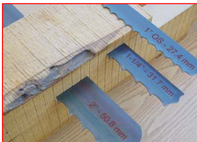
Carbon bandsaws for all makes of sawmills and resaws

GT are Simonds latest innovation, Ground Tooth Bands . Sharp Saws for Super Performance!